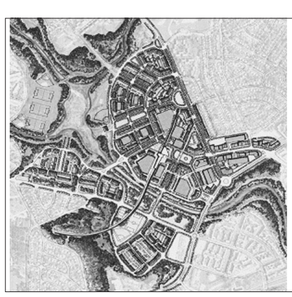
TOD Opportunities: West Hyattsville Metro Station Area.

The West Hyattsville TOD strategy was developed by involving public sector stakeholders and by conducting site, market and