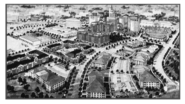
Successful transit-oriented development combines several strategies to achieve several growth and development objectives.